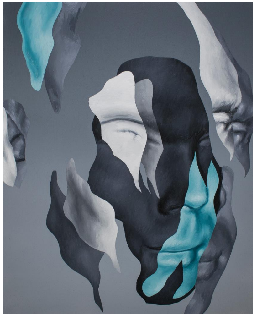
Out of Sight Oil and Acrylic on Board 35.5 x 27.9cm 2021 £700.00