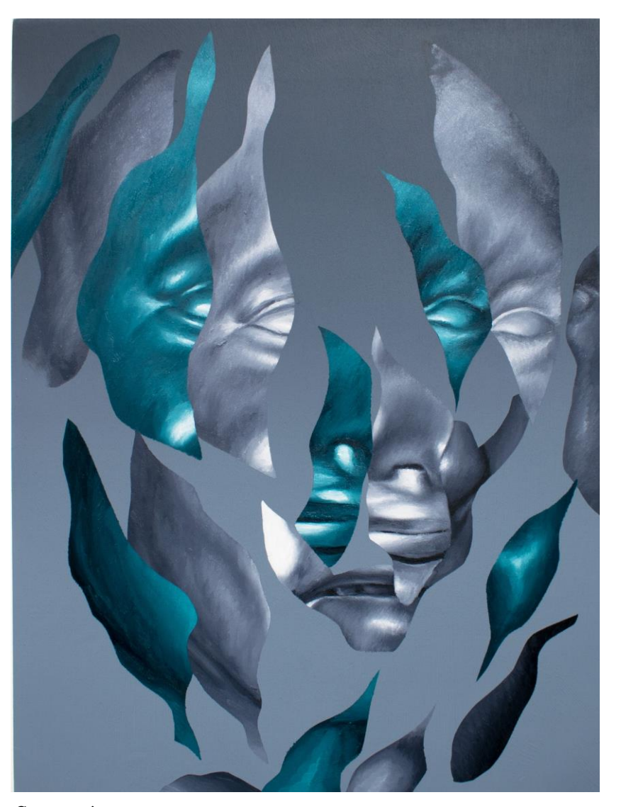
Connector Oil and Acrylic on Board 42 x 30cm 2021 £750.00