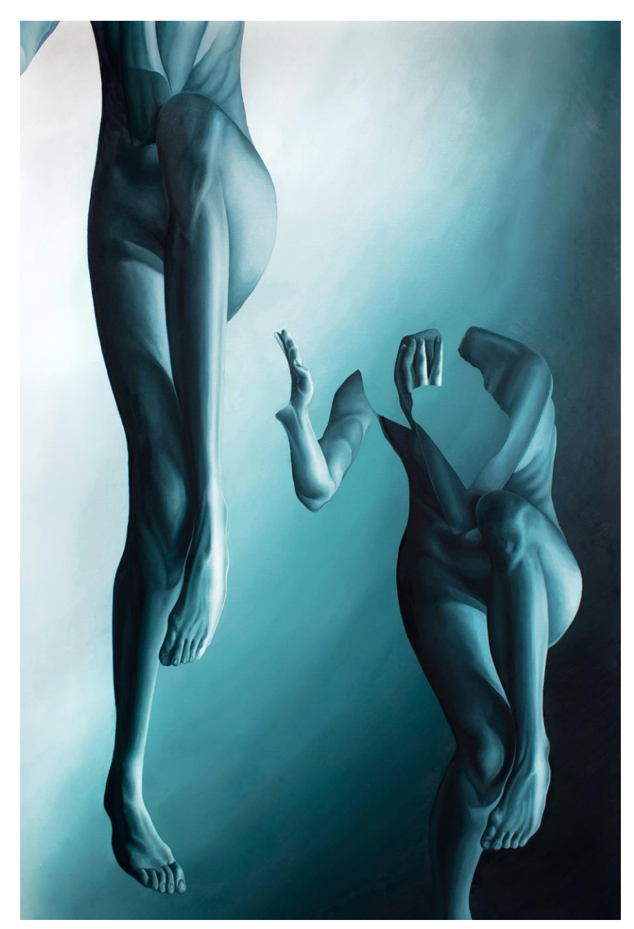
Inflection Oil on Canvas 150 x 100cm 2020 £1,900.00