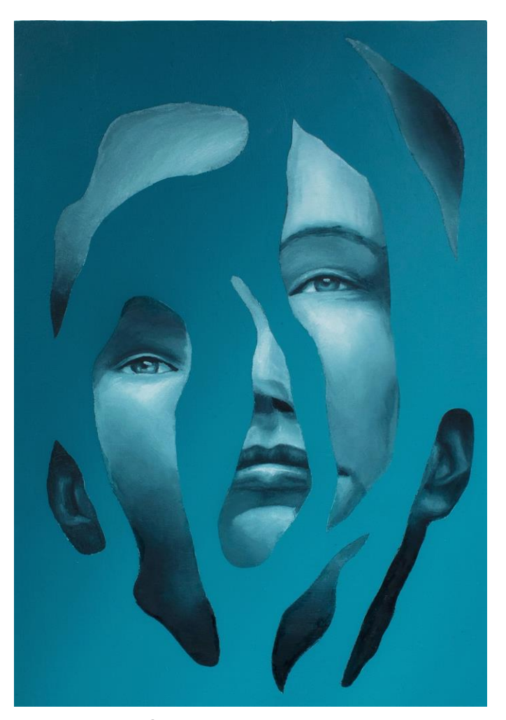
Empty Promoises Oil and Acrylic on Board 42 x 30cm 2021 £750.00