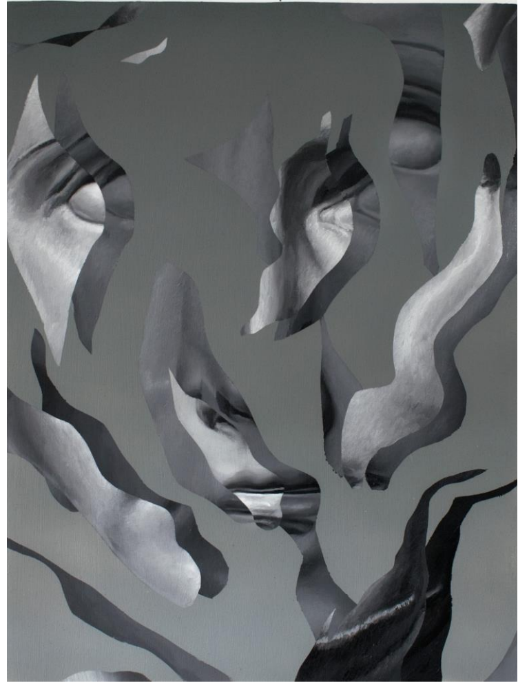
Doppelganger Oil and Acrylic on Board 42 x 30cm 2021 £750.00